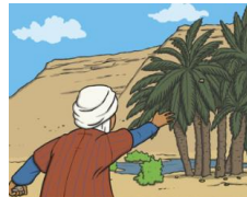
Muslim: The Boy who threw stones at trees