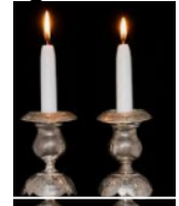
Lighting the Shabbat candles