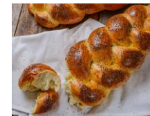
Eating Challah Bread